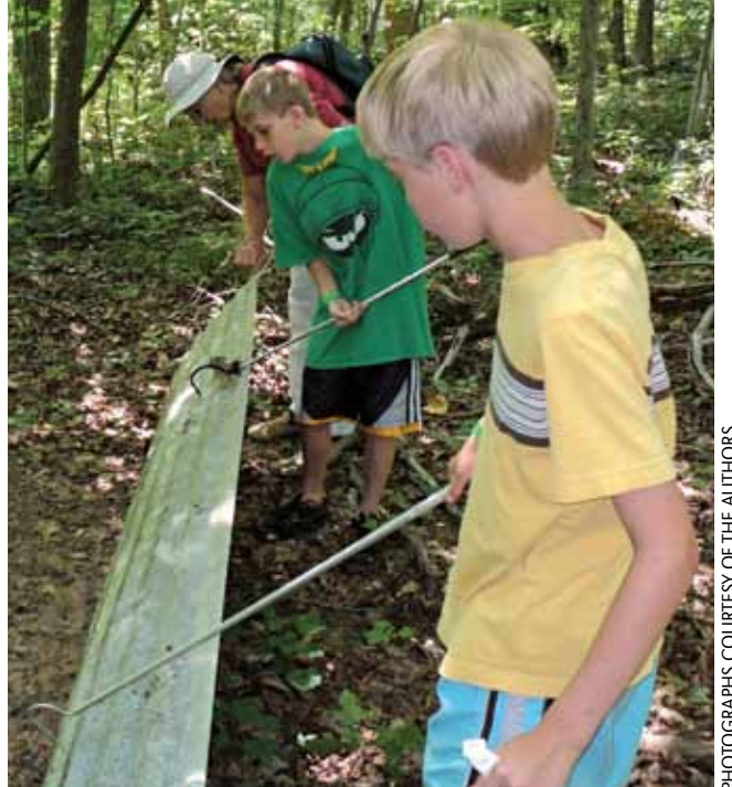
Students carefully lift a cover board and look for animals below.

Direct experiences handling and investigating reptiles and amphibians