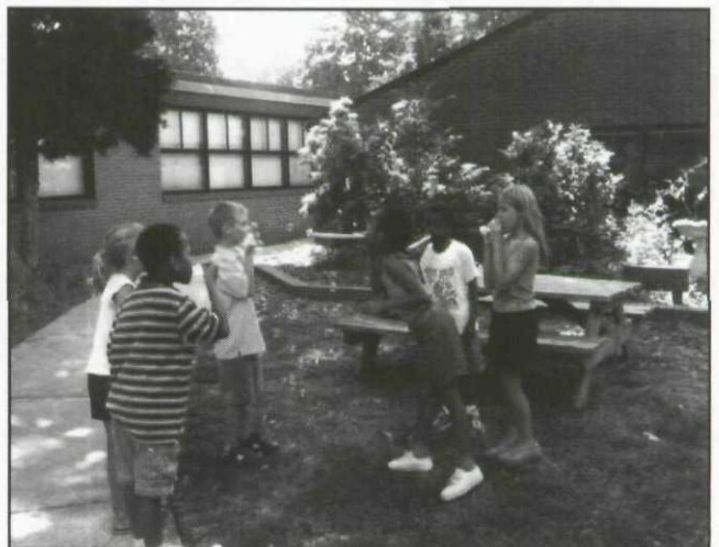
Students try to catch bubbles with blowouts. This activity mimics frogs extending their tongues to catch prey.