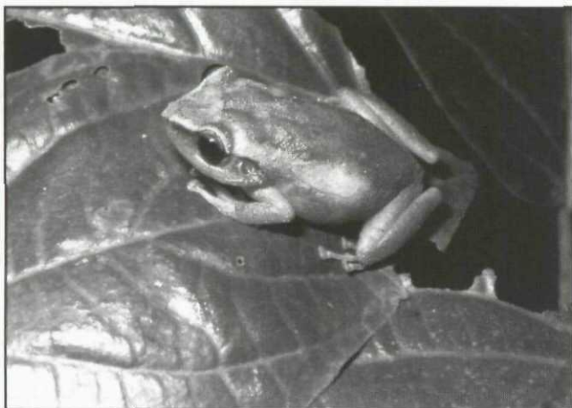
A coqui frog resting on leaves.