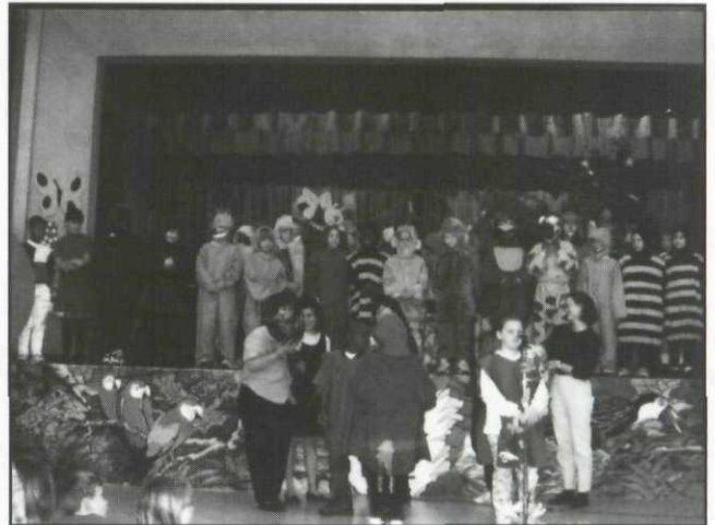
Students in costume participating in the annual performance of "The Great Kapok Tree."

Each grade level studied amphibians through a variety of creative, hands-on activities. Students investigated the mechanics of how frogs eat using bubbles and a common party-favor called a blowout (see Activity 1). The blowouts were used to illustrate the manner in which a frog's tongue is attached at the front of a frog's mouth and flips out as it