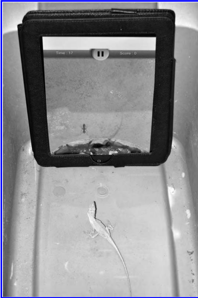
Figure 6. Testing anoles, Anolis carolinensis , on the Ant Crusher game.