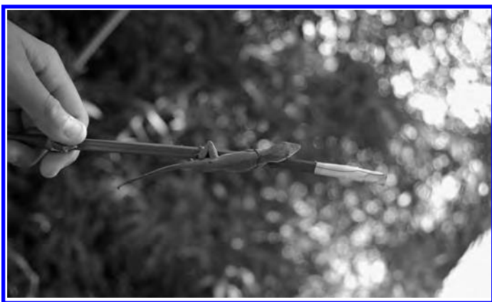
Figure 1. A Carolina green anole, Anolis carolinensis , captured with a lizard lasso.

Why Lizards, and Why Now? The growth of human communities and our effects on natural habitats are having its toll on our lizards, as for so many other taxonomic groups. Habitat loss and fragmentation is the main threat to lizards, but other factors are being raised as issues as well: overexploitation, predation, and climate variation. The purpose of the ...Year of the Lizard ... is to raise awareness for lizard conservation. With place-based management, local populations can thrive. This is a taxonomic group that can benefit by Citizen Science actions.... We believe that citizens, natural resource managers, scientists, and the pet and food and related industries can work together to address issues and to help ensure long-term survival of lizard species and populations. ( http://www.parcplace.org )