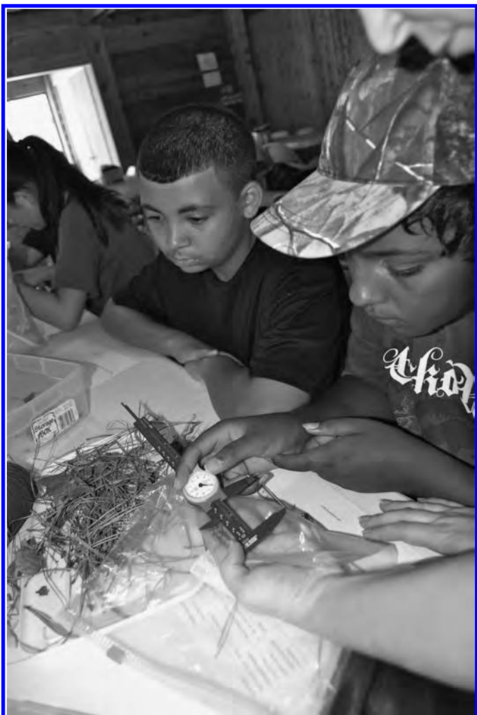
Figure 3. Student measuring a lizard at Rockfish.