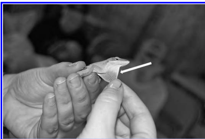
Figure 4. Male anole, Anolis carolinensis , found at Rockfish. Student shows the large, red dewlap (marked with arrow) that distinguishes male anoles from female anoles.