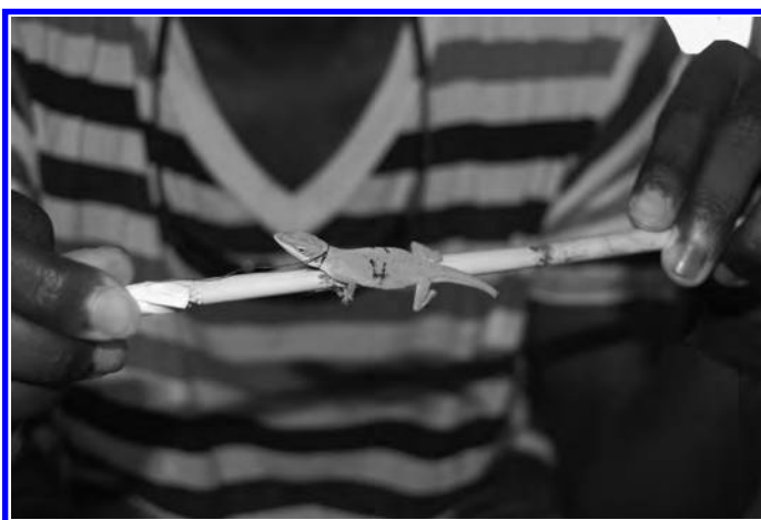
Figure 5. Marked female anole, Anolis carolinensis , with regenerating tail.